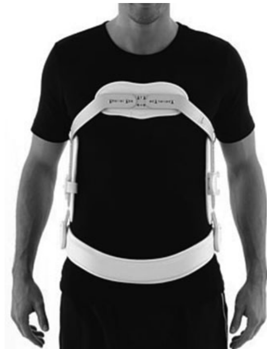
Fig. 4 Jewett brace. (Reproduced with permission, from Ossur UK Ltd.)

Adaptations to this technique have been made for patients with low bone density or dysplastic lamina. Morscher et al described using hook screw fixation to correct spondylolysis defects 19 ; however, this technique has been described as technically difficult. 20 The technique involves bone grafts to