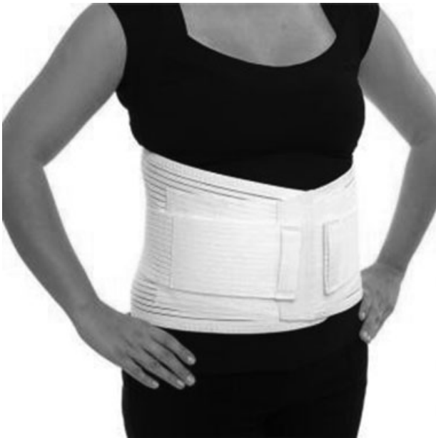
Fig. 1 Non rigid lumbar brace.

LSOs are often prescribed for treatment after arthrodesis for degenerative conditions. Several studies demonstrated little or no immobilizing effect from wearing LSOs and possibly an increase in L4–L5, L5–S1 motion after application of these orthoses. 13,17