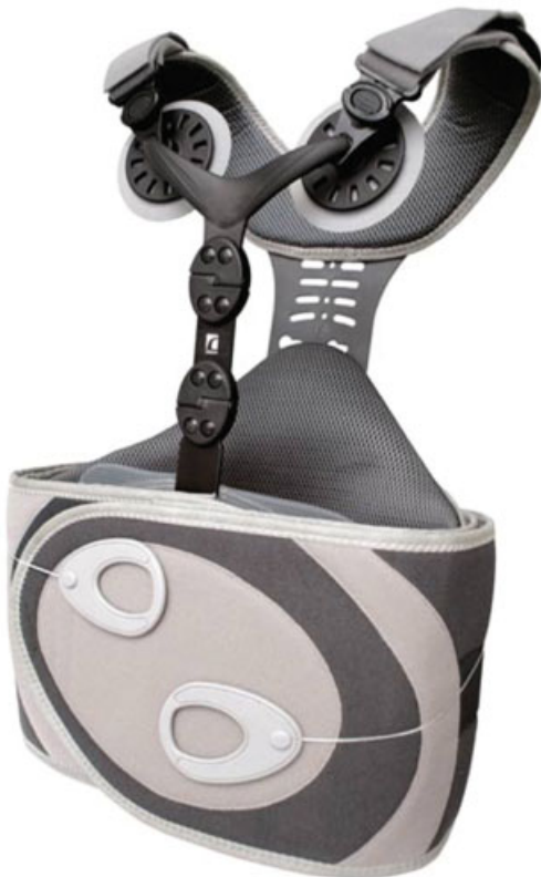
Fig. 2 Thoracolumbosacral orthosis brace. (Reproduced with permission, from Ossur UK Ltd.)

LSOs are often prescribed for treatment after arthrodesis for degenerative conditions. Several studies demonstrated little or no immobilizing effect from wearing LSOs and possibly an increase in L4–L5, L5–S1 motion after application of these orthoses. 13,17