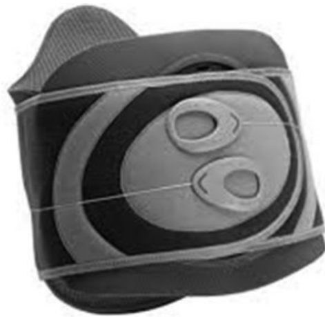
Fig. 3 Lumbo-sacral orthosis brace.