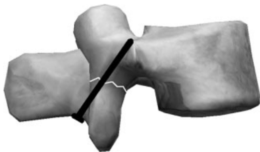
Fig. 5 Buck procedure.

fill the pars defect followed by screws inserted into the superior articular processes bilaterally. These screws are altered such that they accommodate a hook, which hangs over the lamina, which is later secured by a lock nut. This apparatus is fixed to adequately reduce the defect. 21